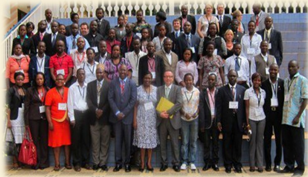
Group photo of the participants who attended 'Claiming Spaces: Tactical Tools for Human Rights Defenders'

The training revealed fertile grounds for employing social media for human rights defenders as well as areas requiring further investigation and deployment including SMS communications and secure protocols for social media. At a time when the space for human rights defenders to work in Uganda is threatened and with HRDs facing many challenges, this forum proved to be timely and insightful to the participants.