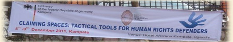
Five day workshop for human rights defenders celebrating Human Rights Day